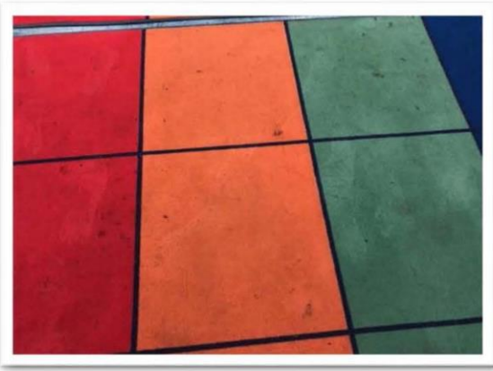
Rug Before Cleaning