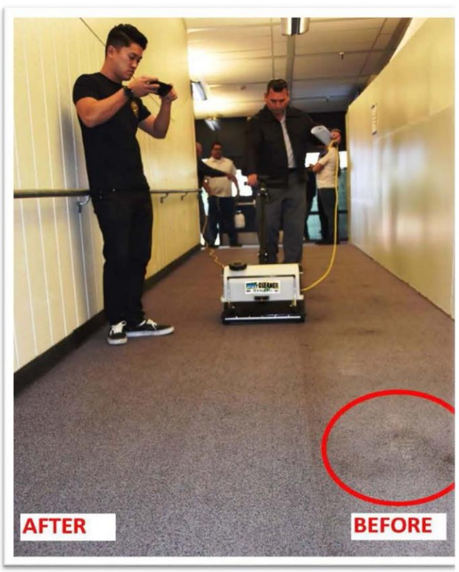
Sonora High School Home Of Raiders Before & After Cleaning